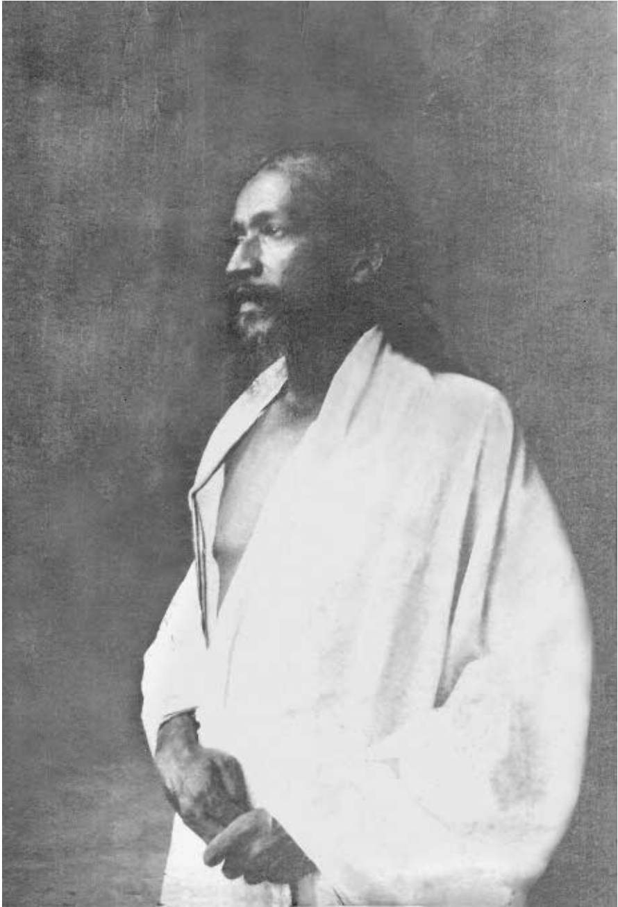
Sri Aurobindo in Pondicherry, c. 1915